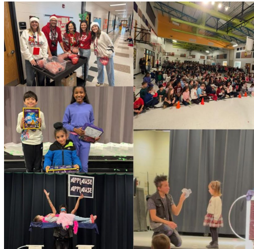
BEACH BASH BOOGIE