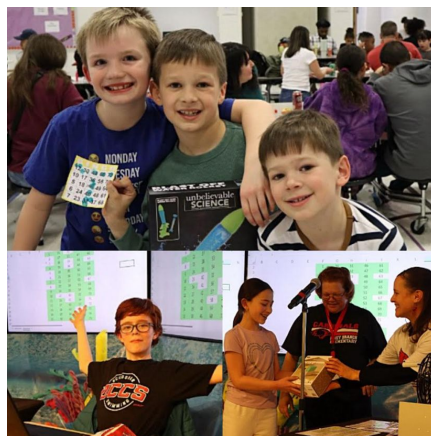
FINAL SPIRIT DAY